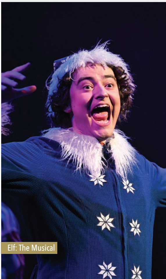
Elf: The Musical

Go to getacceptd.com/nebrskawesleyan and upload the necessary materials. Please include an intro video stating your name, the pieces you'll perform, and something you'd like us to know about you that's not on your resume.