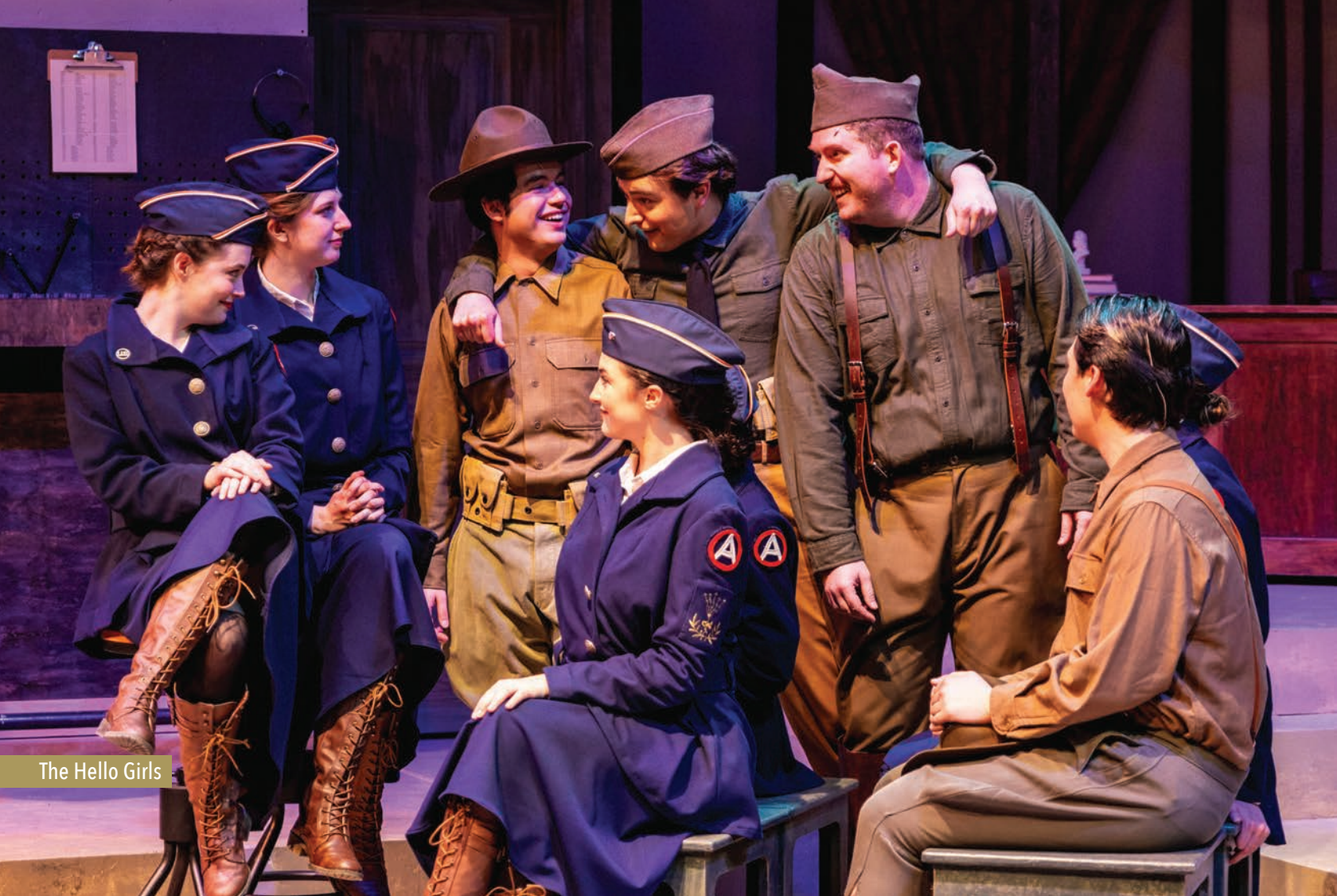
The Hello Girls