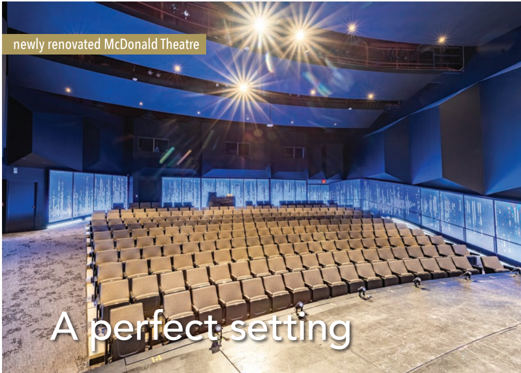
newly renovated McDonald Theatre