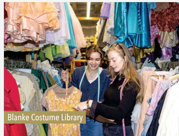
Blanke Costume Library